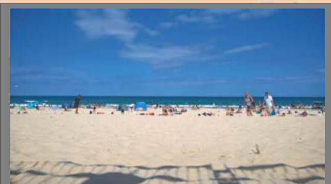
The Gold Coast – BEACH day