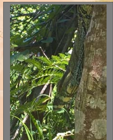
A lizard hiding for cover at GET ARMED