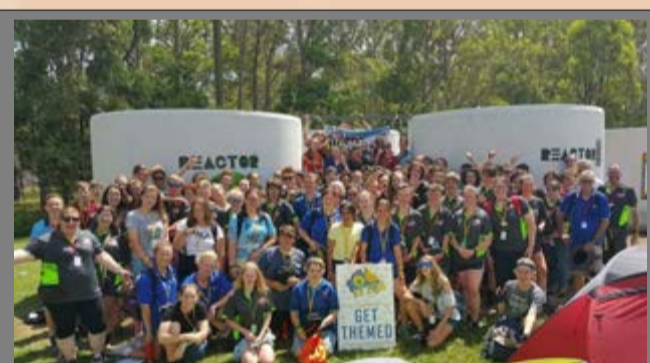
Get Themed Units