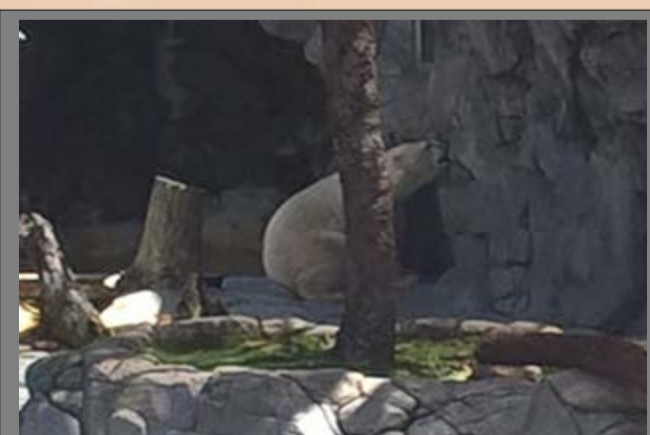
Polar bear at SeaWorld