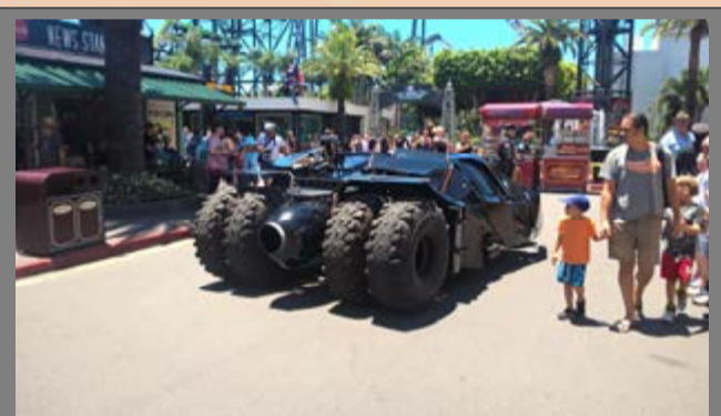
BATMAN is cruising the park