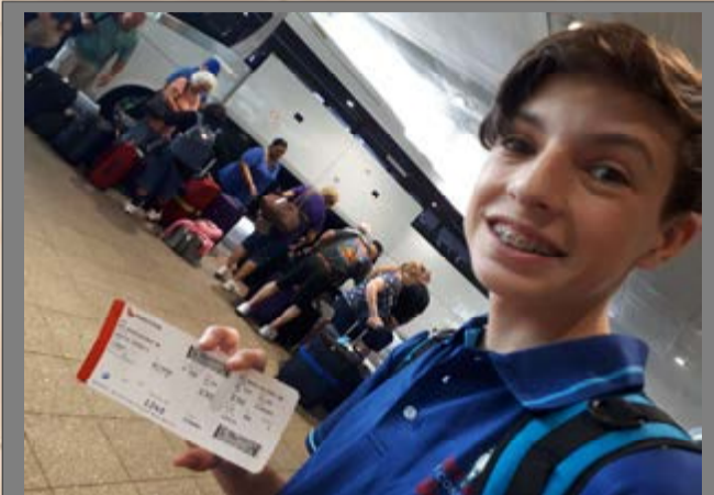
Checked for a fortnight of FUN

NSW Contingent converged on Qantas Sydney Airport to head to the Gold Coast on Monday 1 st January. It was amazing seeing everyone in their NSW shirts wondering the airport with a buzz of excitement. We arrived at the Gold Coast and headed to Baden Powell Campsite for the first night with all of the NSW kids. We got the update of the rules to be followed and then most of us headed off to the pool.