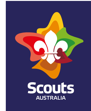
10 Colour Version