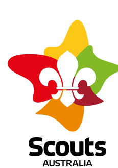
7 Colour Version