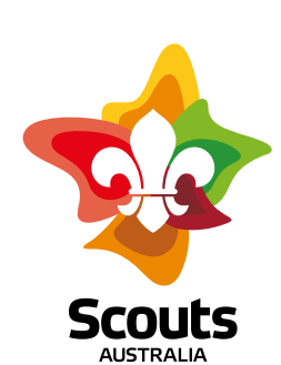
11 Colour Version