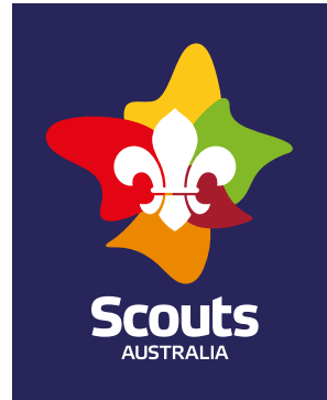
6 Colour Version