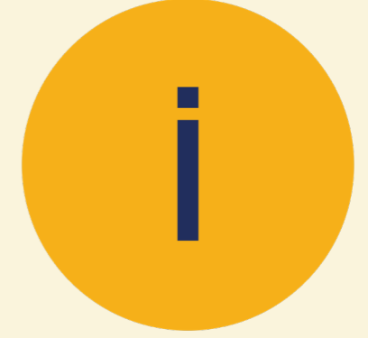
More detailed information about how the Order works

A short PowerPoint slide presentation including key information about the Order of Australia can be provided separately on request.