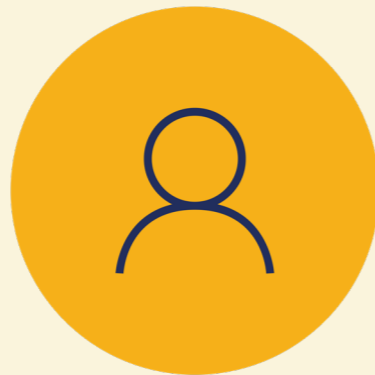
Profiles of inspiring Order of Australia recipients