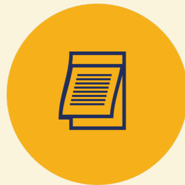
Draft social media post text