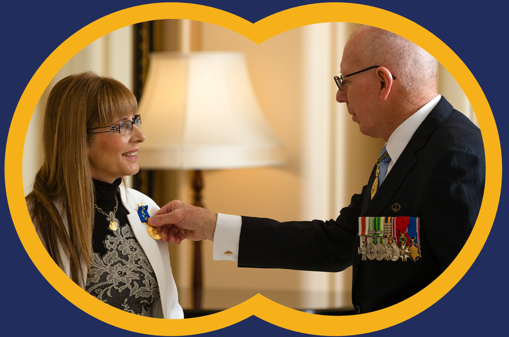
Caption: The Governor-General presenting a recipient with her medal of the Order of Australia

Alt text: A row of gold-coloured medals attached to blue ribbon laying on a green surface