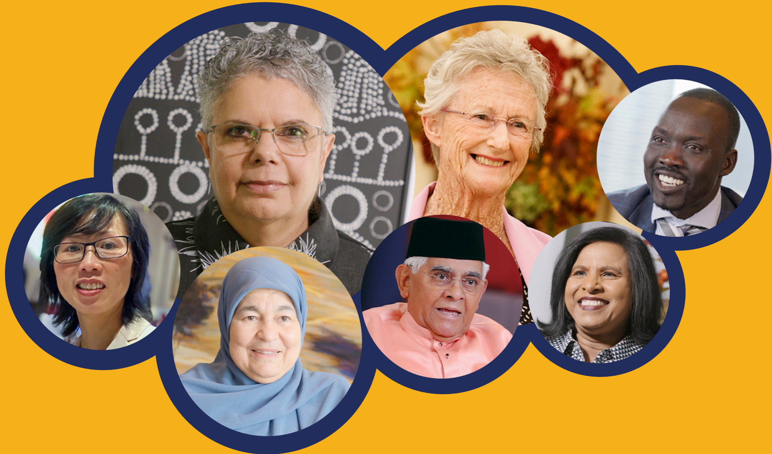
Caption: Order of Australia recipients

Alt text: photo montage of seven smiling people, who are Order of Australia recipients.