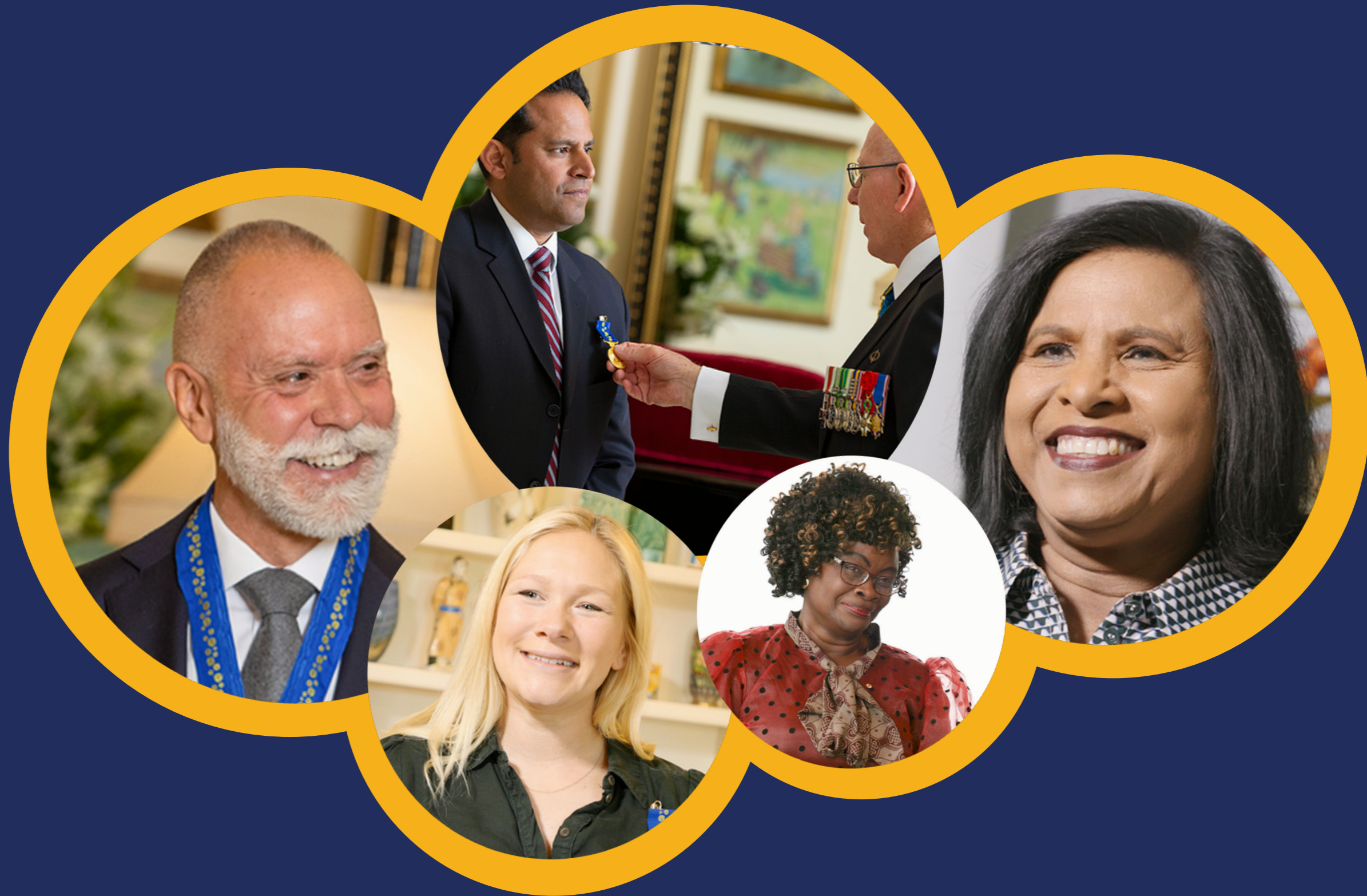
Caption: Order of Australia recipients

Alt text: photo montage of six people, including five Order of Australia recipients, and one of the Governor-General of Australia pinning a medal on a recipient's jacket