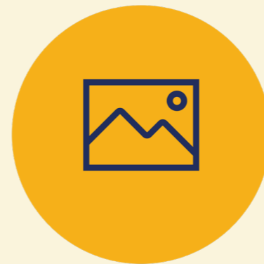
Editorial and images for e-newsletters and websites