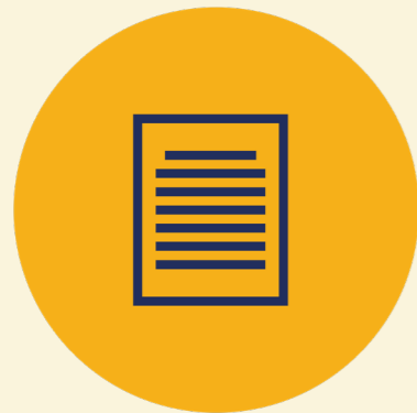
Key messages about the Order of Australia

We want you to share these messages and stories to help us inspire more Australians to nominate people who go above and beyond and have great impact in our community.