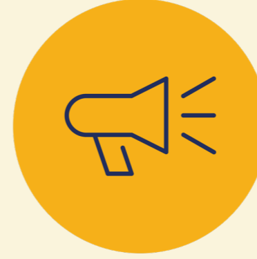
Ready-to-use promotional material for your channels