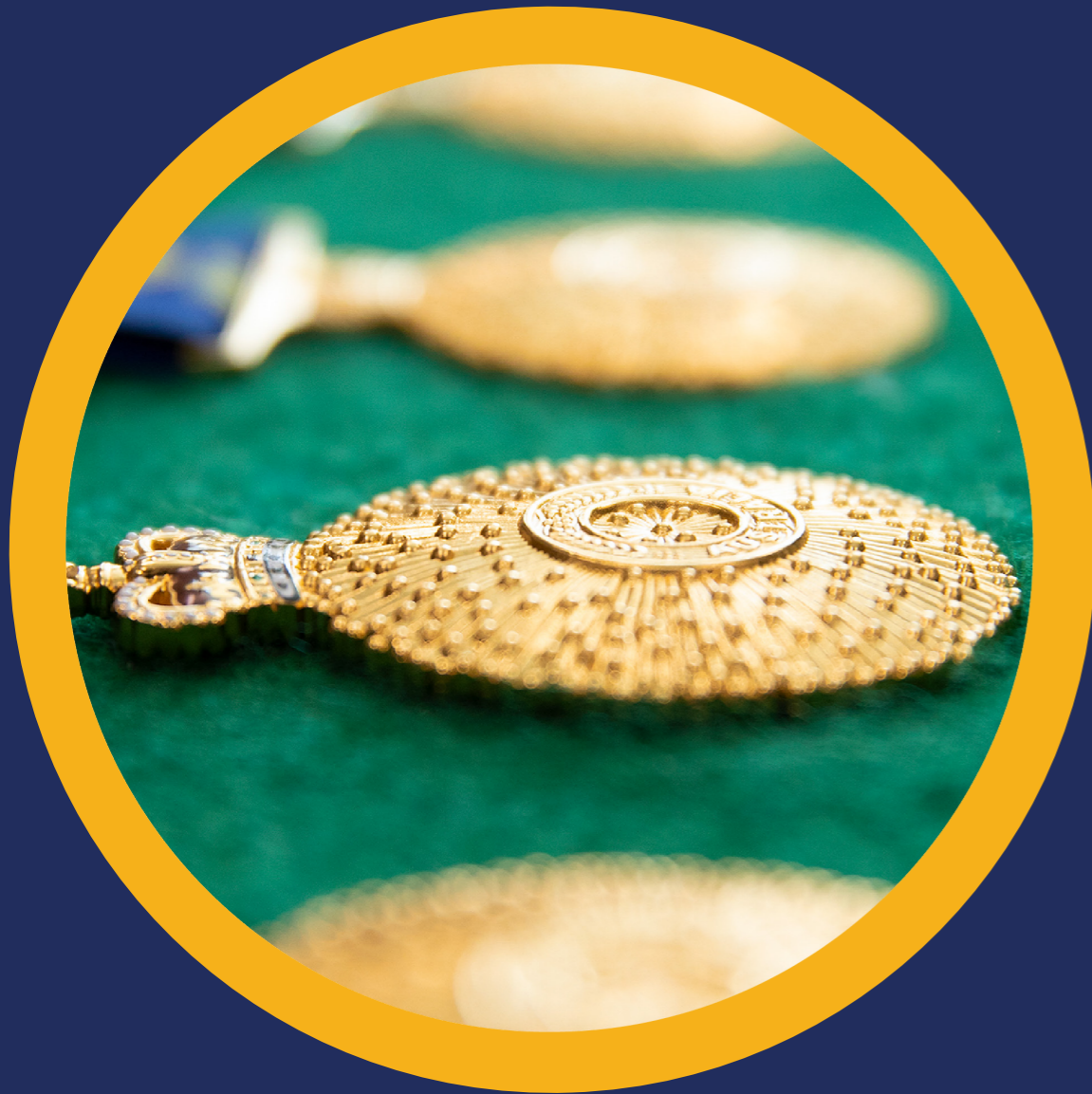
Caption: Order of Australia medal

Alt text: A row of gold-coloured medals attached to blue ribbon laying on a green surface