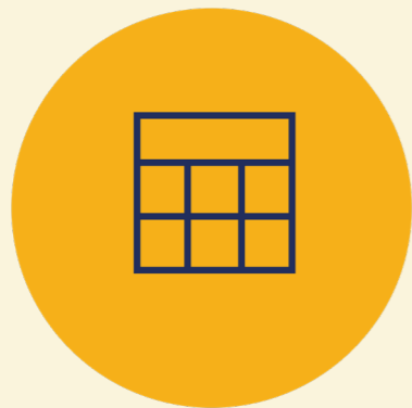
Ready-to-use social media tiles

With this suite of materials you can deliver clear and consistent messages about the Order of Australia across your communications channels.