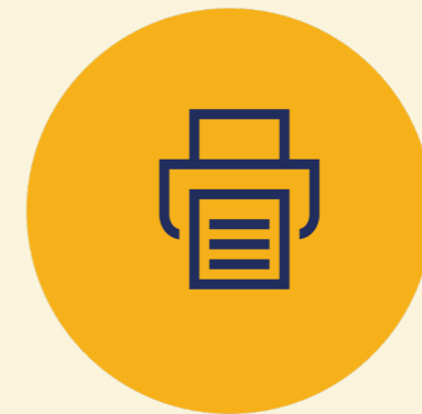
Printable A4 Fact Sheet